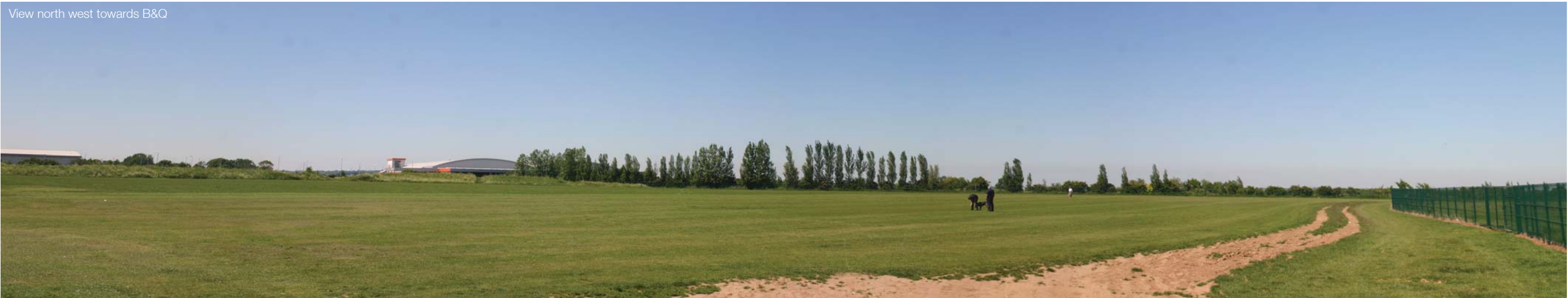
View north west towards B&Q