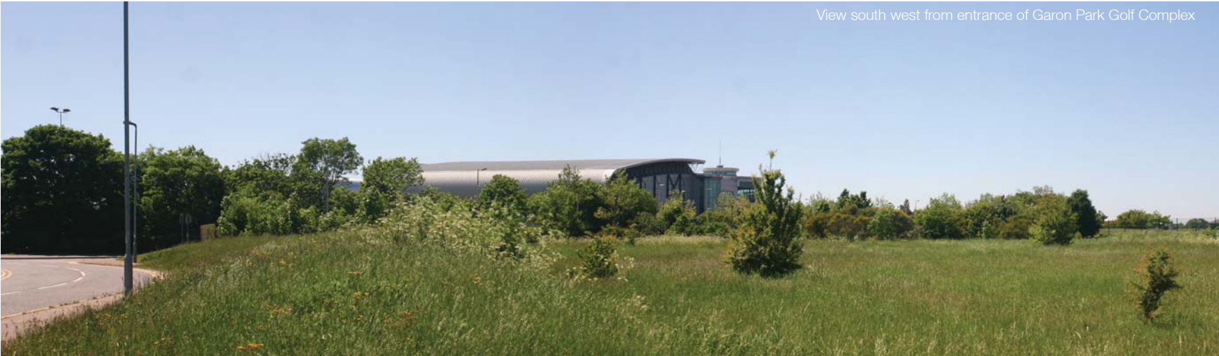
View south west from entrance of Garon Park Golf Complex